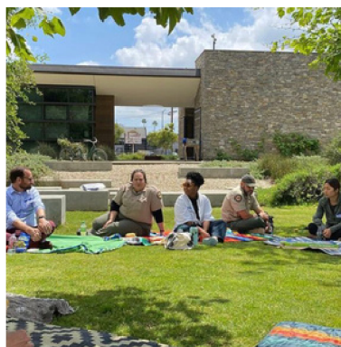
Participating in a Wilderness Society-hosted meeting with coalition partners, local organizations and state leaders.