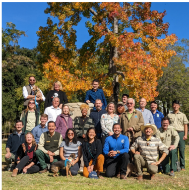
We remain a proud member of the San Gabriel Mountains Community Collaborative.