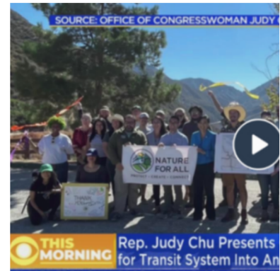
CBS This Morning TV ran a segment on the news of funding for our transit-to-trails work.