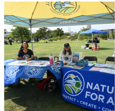
Our Latino Conservation Week event, "Fiesta y Comunidad," at LA State Historic Park.