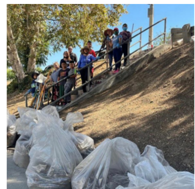
Teaming up with the community of Panorama City and North Hills for a clean-up.