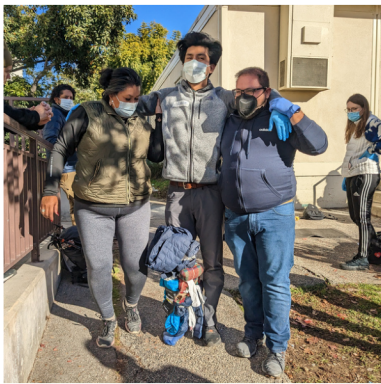
Coalition member Sierra Club sponsored a wilderness first aid training session for team and community members.