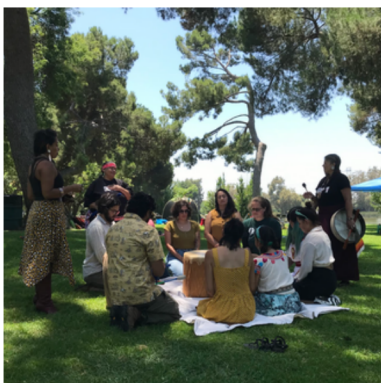
Partaking in a workshop led by One Drumm, an inter-tribal drumming group.