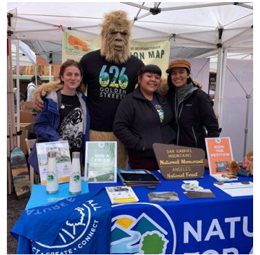
Left to right: Leadership Academy; Leadership Academy Project; Leadership Development Community Breakfast; 626 Golden Streets.