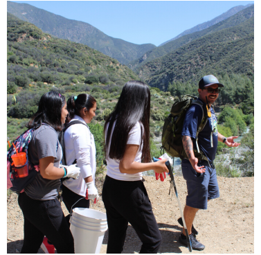
Left to right: Congresswoman Judy Chu at our Earth Day event, sharing news of the re-introduction of our San Gabriel Mountains Foothills and River Act; participating in Latino Conservation Week; our inaugural All Aboard for Nature event; National Trails Day hike and clean-up.